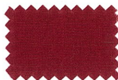
03 DARK RED