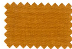
67 OCHER BROWN