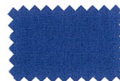
72 BRILLIANT BLUE