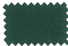
10 OLIVE GREEN