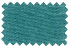
70 EMERALD GREEN