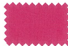
61 ROSE PINK