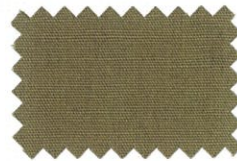
66 KHAKI BROWN