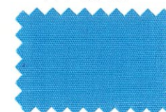
11 SKY BLUE