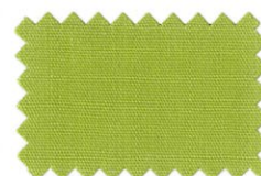
69 SPRING GREEN