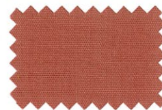
68 ORCHID BROWN