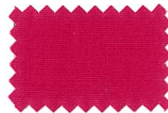
62 CARDINAL ROUGE