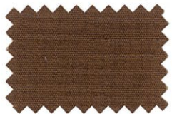
08 DARK BROWN