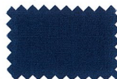
14 NAVY BLUE